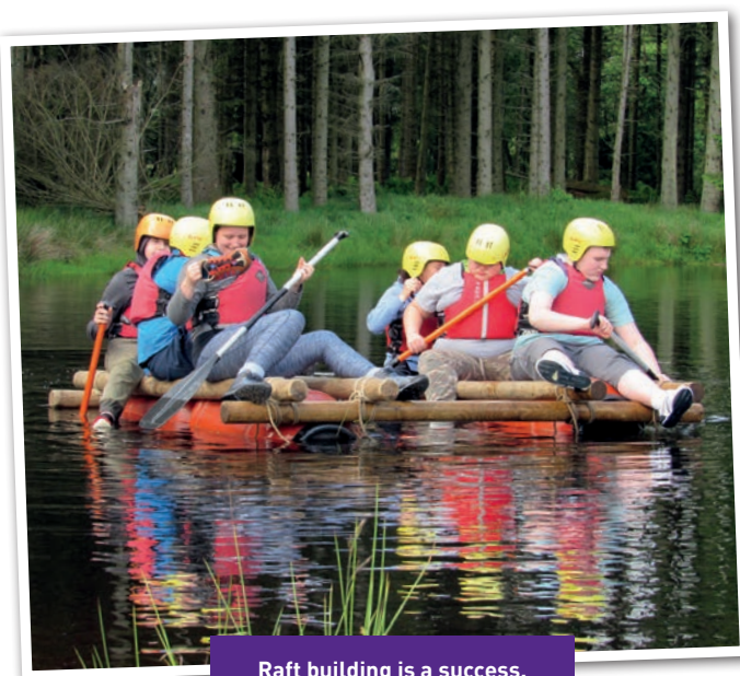
Raft building is a success.

A big thank you to everyone who attended the Family Fun Day, raising over £1,600 for the annual school trip. Another thank you to the Lendrick Muir staff for helping facilitate the trip, making it an enjoyable time for everyone!