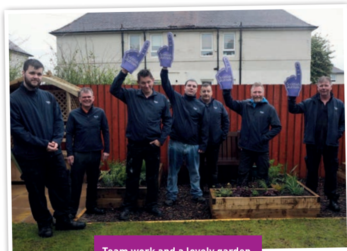
Team work and a lovely garden.